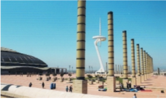
Montjuïc esplanade prepared for the 1992 Olympic Games.