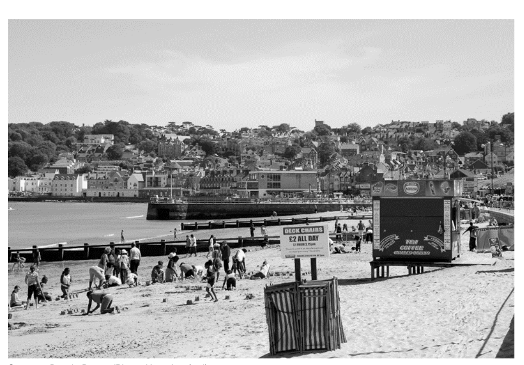
Swanage Beach, Dorset

How does the local economy change seasonally? Is the local economy sustainable in the long term? How might future seasonality in the economy be managed?