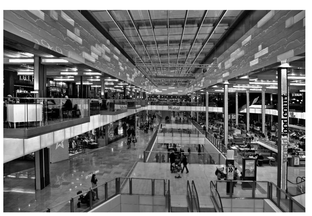
Westfield Shopping Centre, Stratford

Has this retail space created competition for goods and services produced more locally? How has this competition affected people's shopping habits?