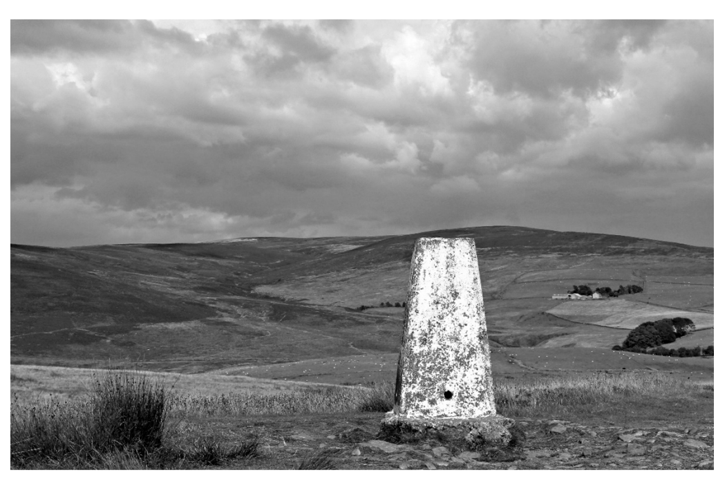
Forest of Bowland, Lancashire

Why do people like to visit this area? Where do visitors come from? What activities do they take part in here? How are these activities monitored and managed?