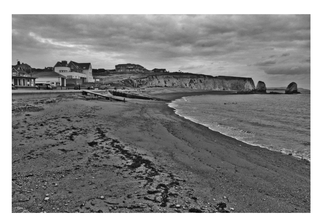
Freshwater Bay, Isle of Wight

How does this landscape compare with others in the locality? In what ways is it similar or different to other locations like it?