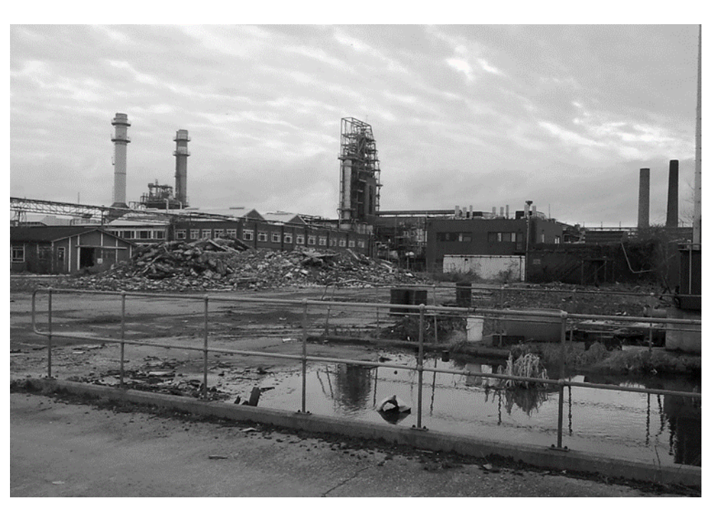
Castleford, West Yorkshire

How does a site like this relate to a wider, global historical context of industrial decline? How might its future play a role in other global initiatives?