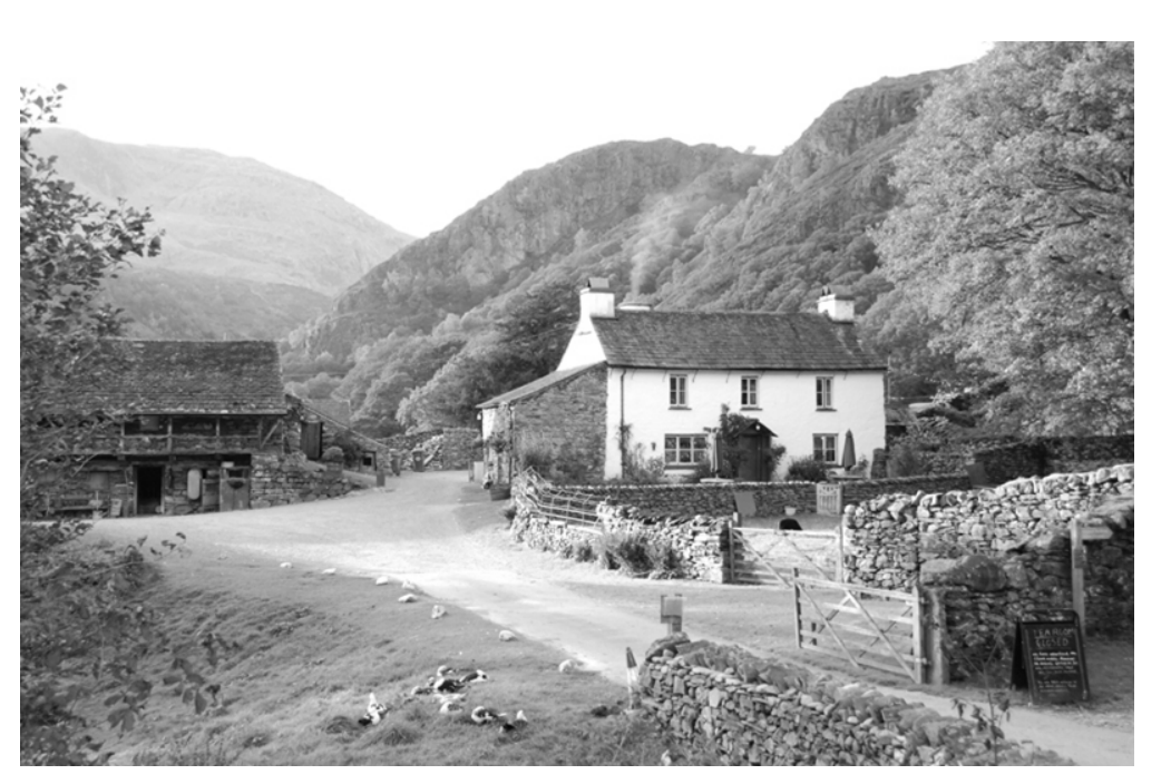
Coniston, Cumbria

Who are the various stakeholders involved in the stewardship of an environment such as this? How might they sometimes appear to be in conflict with one another?