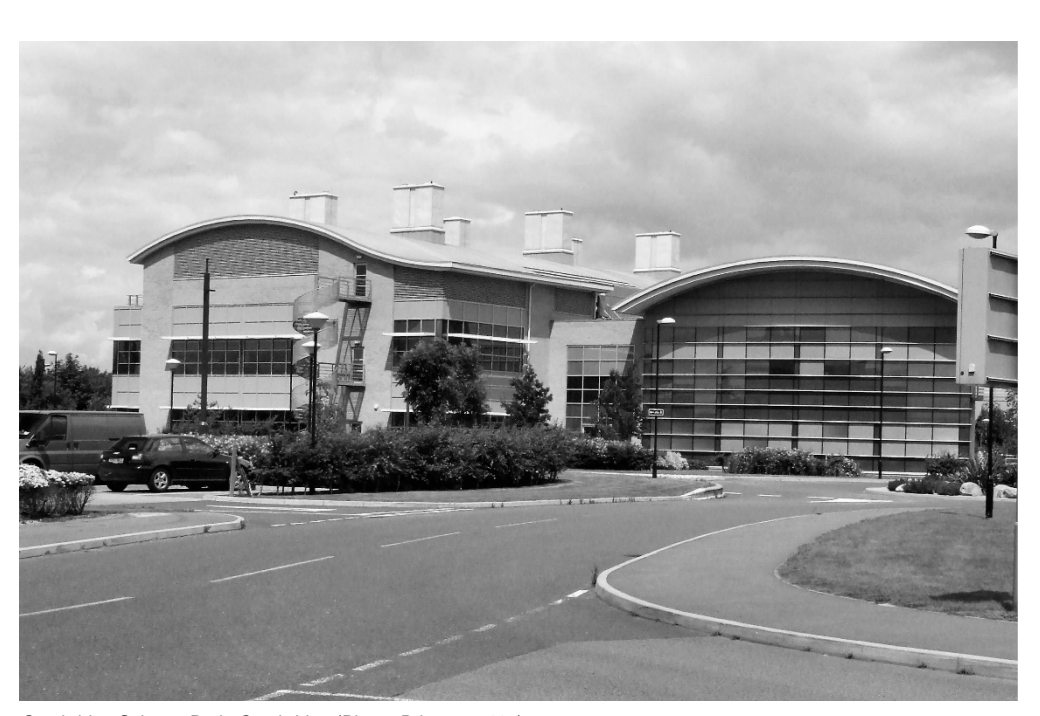
Cambridge Science Park, Cambridge

What connections does this work space have with the local community? Does the creation of industry in this space trickle down to other spaces around it?