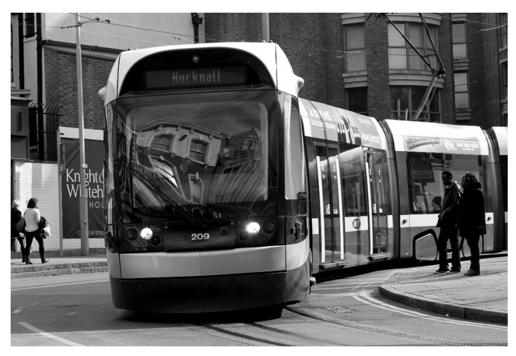
Hucknall Tram, Nottingham

How does this transport system play a wider role in connecting people across the region? What other factors are there to create a more connected region?