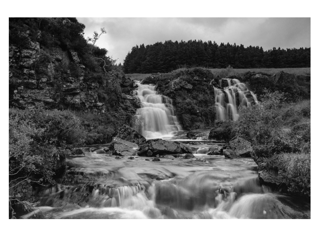
Glen Brittle, Isle of Skye

How might different weather conditions affect the processes taking place in the river channel? When are these conditions most likely to change?